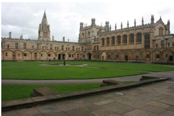
Christ Church College, Oxford, UK

The 2008 ecbi Oxford Fellowships took place between 1 and 5 September 2008. They were attended by 11 Fellows from Argentina, China, Ghana, India, Mexico, Pakistan, South Africa, and Vietnam. Negotiators from Belgium, Denmark, Germany, Norway, Slovenia, Spain, Sweden, Switzerland, the UK, and the European Commission joined the Fellows for the Oxford Seminar from 3 to 5 September. The emphasis of the interaction between the participants was again on trust-building, as this was seen as a crucial element in the success of the UNFCCC negotiations. This resulted in a frank and open exchange of views about the issues on the agenda