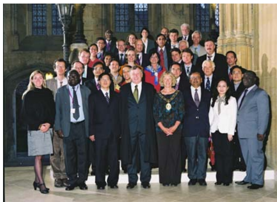
Participants of the Oxford Seminar 2008 at the Christ Church College Dinner

Participants noted that although a number of proposals, spanning a wide range of issues, were now on the table, the actual negotiations had not yet begun. They hoped for a boost in the process by COP 14 in Poznan.